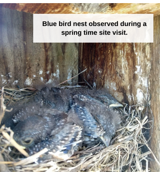
Blue bird nest observed during a spring time site visit.