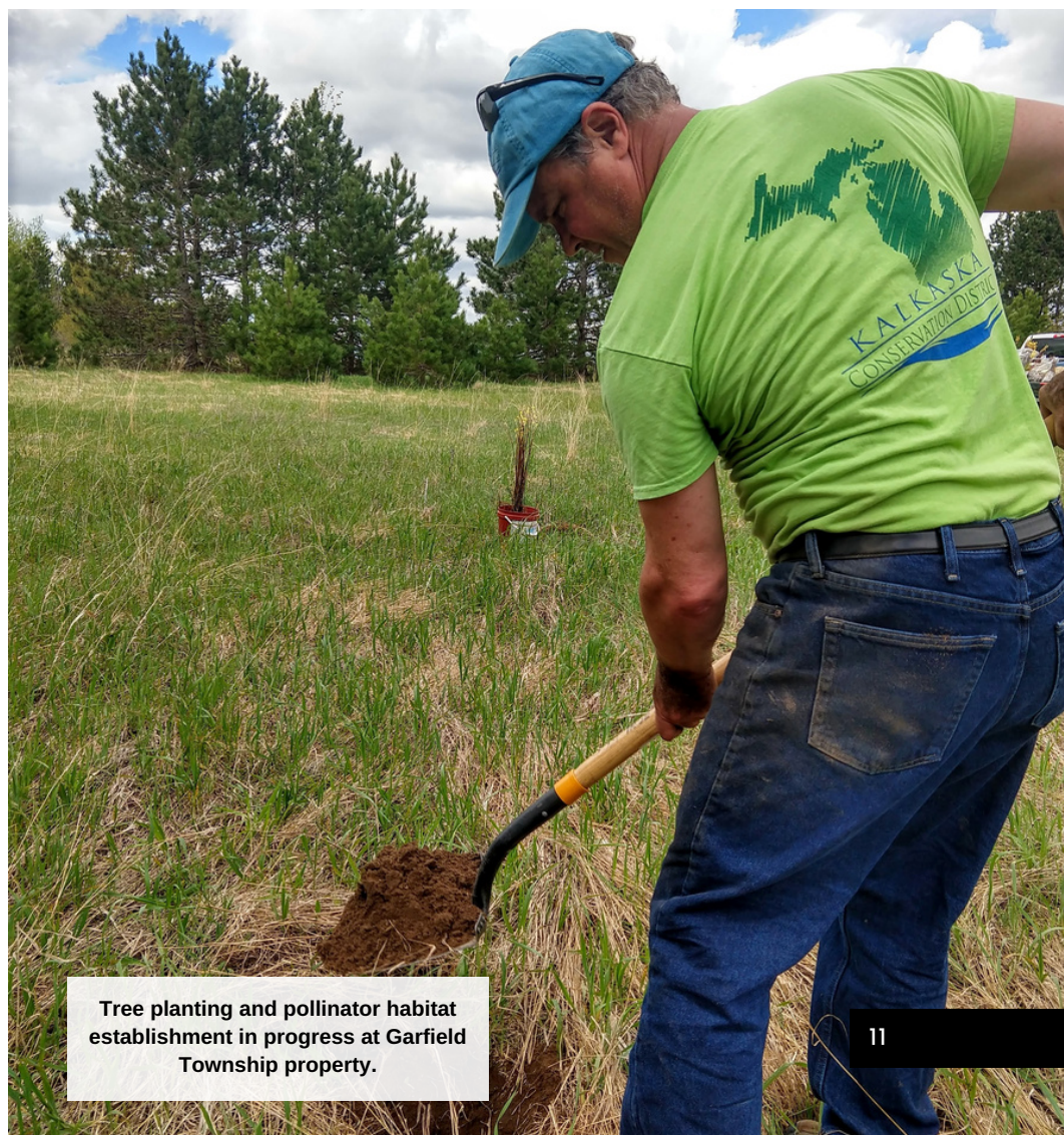
Tree planting and pollinator habitat establishment in progress at Garfield Township property.