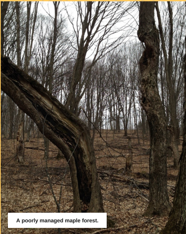
A poorly managed maple forest.

Contact Larry today larry.czelusta@macd.org or (231)775-7681 x3