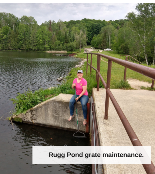
Rugg Pond grate maintenance.